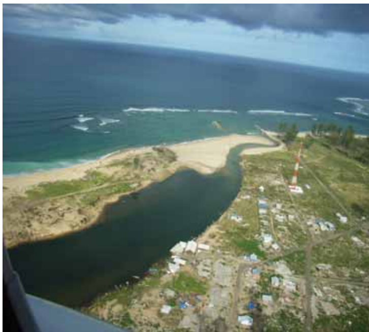
Close-up of coastal Sumatra

Calang, where I am writing this, is accessible by road and by the UN's helicopter flights. I just got off a Russian MI-8 helicopter, after a 45 minute flight from Banda Aceh, where I had my visa renewed. We'll be driving to Teunom, along what is left of the coast highway, and which only has cellphone coverage on some days, and only by standing on the steel bridge and hoping. So I am in the country now, after four months in an office tent in the UN camp.