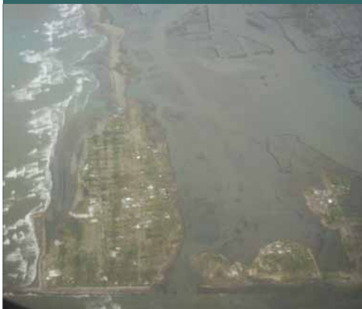
Tsunami ravaged Sumatra

Calang, where I am writing this, is accessible by road and by the UN's helicopter flights. I just got off a Russian MI-8 helicopter, after a 45 minute flight from Banda Aceh, where I had my visa renewed. We'll be driving to Teunom, along what is left of the coast highway, and which only has cellphone coverage on some days, and only by standing on the steel bridge and hoping. So I am in the country now, after four months in an office tent in the UN camp.