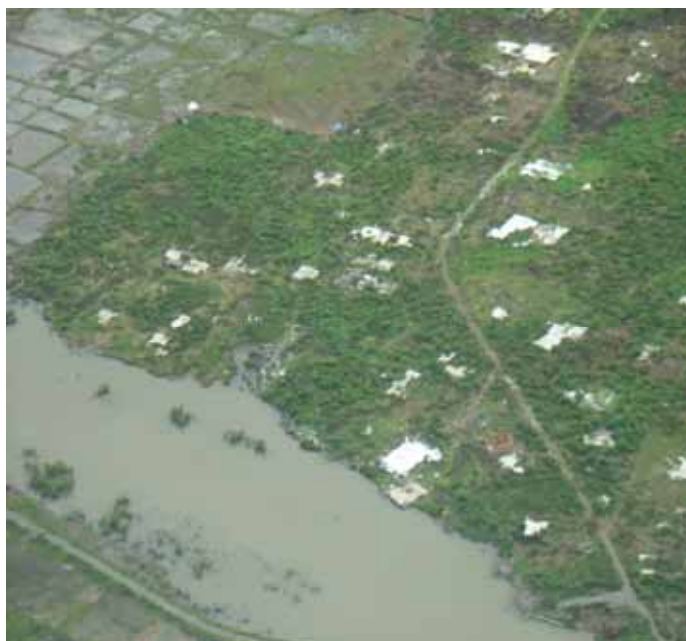
Flooded fields and ruined buildings

I am now a volunteer Data Coordinator for ADRA, building temporary Houses and schools in Teunom, Aceh Jaya. The UN contract lasted four months, and at the end of it I did not want to leave Sumatra. I also wanted to get out in the country more, which I have done.